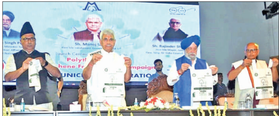
Union Minister Hardeep Singh Puri and LG Manoj Sinha launching bio-plastic carry bag developed by DRDO under Polythene-free Jammu initiative on Friday.