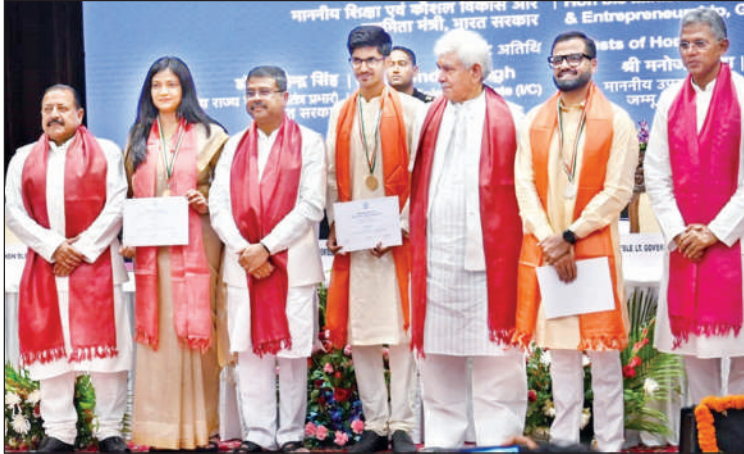
LG Manoj Sinha and Union Ministers Dharmendra Pradhan & Dr Jitendra Singh during 6th Convocation Ceremony of Indian Institute of Management, Jammu, on Friday.

This is the beginning of a new chapter of your life. Be ready for the challenges. Don't remain in your comfort zone. You must not only look forward to becoming job creators but aspire to