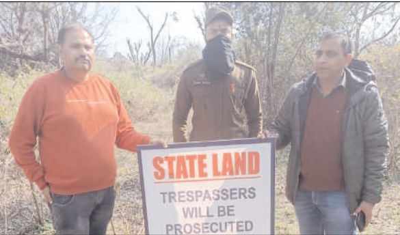
Revenue officers during the anti encroachment drive at Samba.