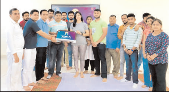
A dignitary being honoured by the management.