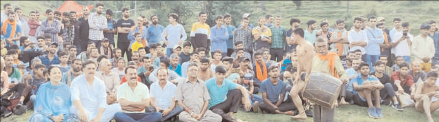
DPAP leaders participating in Mela at Pancheri.