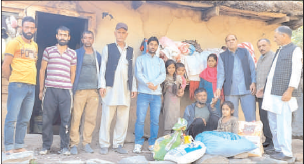
Sabha members providing ration to family.