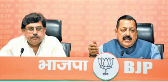
Union Minister Dr Jitendra Singh addressing a press conference at BJP National Headquarters at Deen Dayal Upadhyay Marg, News Delhi on Monday.

■ STATE TIMES NEWS NEW DELHI: Modi Govt provided nearly 9 lakh Central government jobs against UPA Govt's just around 6 lakh in 9 years of their rule from 2004 to 2013 and 2014 to 2023 respectively. This was disclosed here on Monday by Union Minister, Dr Jitendra Singh who substantiated each of his observations with comparative facts and figures while addressing a press conference at BJP National Headquarters at Deen Dayal Upadhyay Marg here. The Minister said, there has been a substantial rise in employment generation during the nine years of the Modi Government. He said, during the six Rozgar Mela launched by Prime Minister Shri Narendra Modi, mass recruitments have been initiated, over 70,000 appointment letters issued in each of the campaigns. Giving details, Dr Jitendra Singh said 8,82,191 Central Government vacancies have been filled up in the last nine years, compared to 6,02,045 in the first nine years of UPA. Three major government agencies, - the UPSC recruited 50,906 candidates during 2014-23 compared to 45,431 during 2004-13, the SSC selected 4,00,691 candidates as against 2,07,563 by the UPA and the RRBs gave government jobs to 4,30,592 youth from 2004 to 2013 as