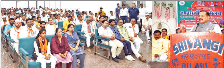
Union Minister Dr Jitendra Singh interacting with beneficiaries of various government schemes at Sumbhal, UP, on Thursday.

The Minister said, there has been a paradigm shift in