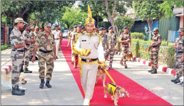
CISF officials with snipper dogs during a programme.

The retired dogs will now be handed over to Friendicoes-SECA, Delhi to be put up for adoption.