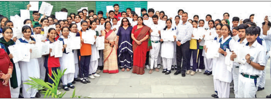
DPS Jammu students posing for photograph with faculty and management member.