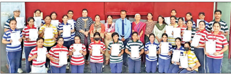
Jodhamal Public School students posing for a photograph with faculty members.

He further urged them to march ahead with a resolve to build a glorious, developed and inclusive nation in the next 25 years, the AmritKaal for India. He further emphasized that the nation's future will