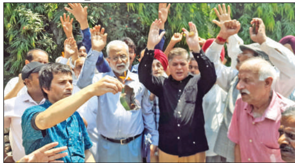
PoJK displaced people raising slogans during a protest.

isation of migrant Kashmiri Pandits, voiced its support for the families of minority community members who lost their lives in the recent terrorist attack in Dangri village of Rajouri district on the occasion.