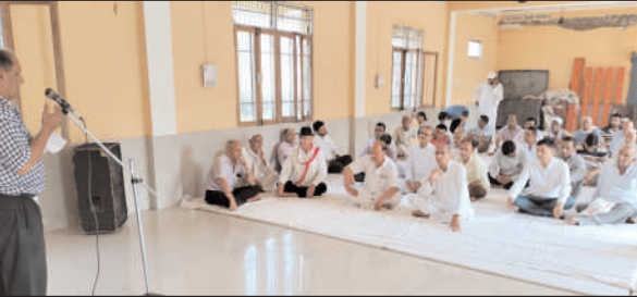
Office-bearers of Brahman Sabha Hiranagar and Bhagwan Parshuram Dham Mandir Management Committee Gurah Mundian during condolence meeting.