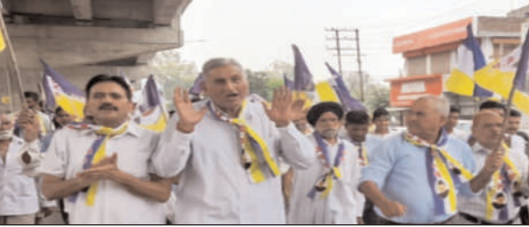
DPAP leaders taking out protest rally at Samba.