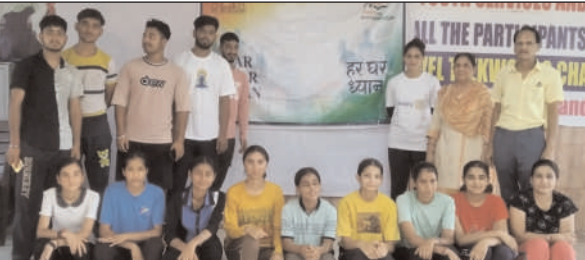
Organisers along with participants.