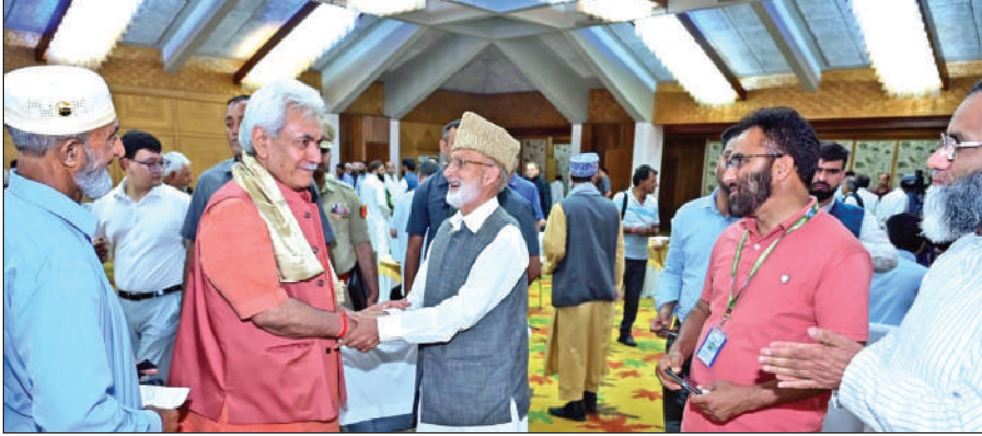
LG Manoj Sinha interacting with prominent members of PRIs, civil society groups, trade & business and spiritual leaders at Srinagar on Sunday.

Society has always welcomed the devotees of Baba Amarnath Ji with open arms and has ensured their needs are taken care of. This is a