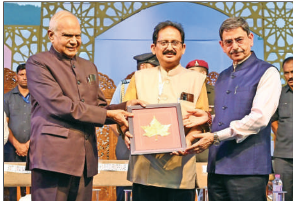
Governors of Punjab and Tamil Nadu, Banwarilal Purohit and R. N. Ravi being honoured during the fest.

and Tamil Nadu, Banwarilal Purohit and R. N. Ravi were present as chief guests at the closing ceremony.