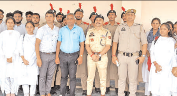
Police officers along with faculty and students during the event.