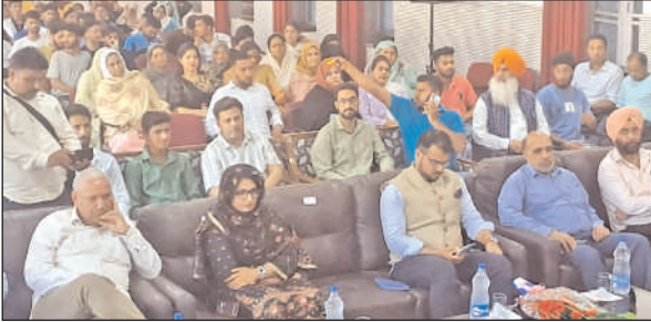
A section of dignitaries during the programme.