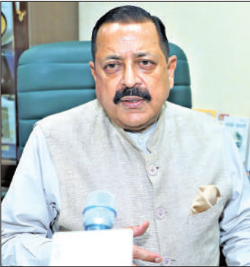
Union Minister Dr Jitendra Singh speaking in an interview at New Delhi.

■ STATE TIMES NEWS NEW DELHI: Union Minister, Dr Jitendra Singh on Wednesday hailed the Union Cabinet approval for establishing the "National Research Foundation" (NRF). The approval came in response to a proposal moved by the Ministry of Science & Technology in the cabinet meeting this morning. The Union Cabinet chaired by Prime Minister Modi approved the introduction of National Research Foundation(NRF) Bill 2023 in the parliament to establish NRF that will function as a high level think tank for coordination and long term as well short term planning. It will also seek to create infrastructure and