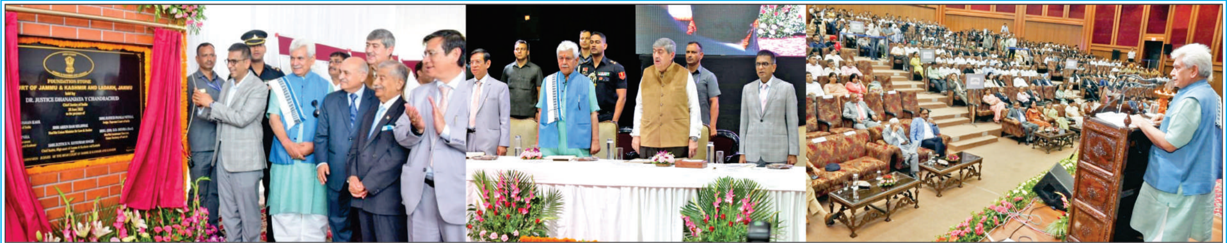
Glances of foundation stone laying ceremony for the new High Court complex of J&K and Ladakh at Jammu on Wednesday.