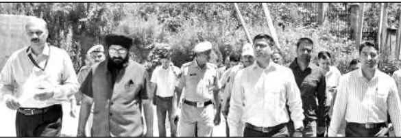
DC Rajouri, Vikas Kundal during visit to District Hospital at Kheora.