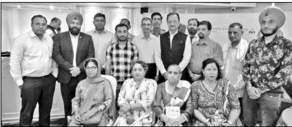
Cancer survivors along with doctors at hospital.