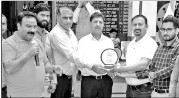
Dignitaries being honoured during the Mela.

District administration has made elaborate arrangements for the smooth conduct of the Mela like uninter-