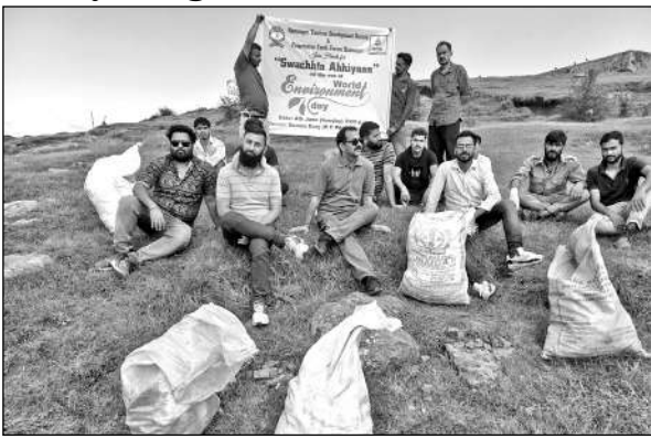
Society members during cleanliness drive at Ramnagar.

TB screening is an effective method for identifying people who may not otherwise seek treatment due to misinformation or misunderstanding about their symptoms. It helps ensure that TB is diagnosed early and treatment is initiated as soon as possible, reducing the risk of transmission