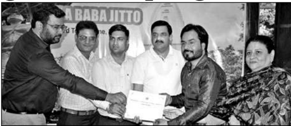
Participants being given certificates during the programme.