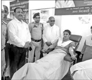
A volunteer donating blood.

blood donation is such a beautiful gesture of selfless service in which only the good of the world is in mind then, the feeling does not arise in the heart that not only our relatives or our family is important but, the whole world becomes our family.