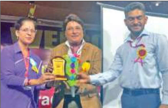
RMPS faculty presenting memento to the resource person.