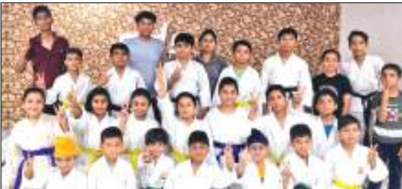
Participating students after receiving belts.