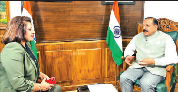
Union Minister Dr Jitendra Singh in an exclusive interview with Doordarshan News, at New Delhi on Monday.

■ STATE TIMES NEWS NEW DELHI: Out of 424 foreign satellites launched till date by India, as many as 389 were launched in the last 9 years of the government headed by Prime Minister Narendra Modi. Further, out of 174 million US dollars earned, 157 million came in the last 9 years and similarly out of 256 million Euros earned so far, 223 million came during the 9 years of the Modi regime. This was disclosed here today by Union Minister, Dr. Jitendra Singh on Monday in an exclusive interview with DD News. The Minister said