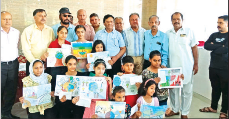
Kotli Mahajan Sabha members posing with winner students.