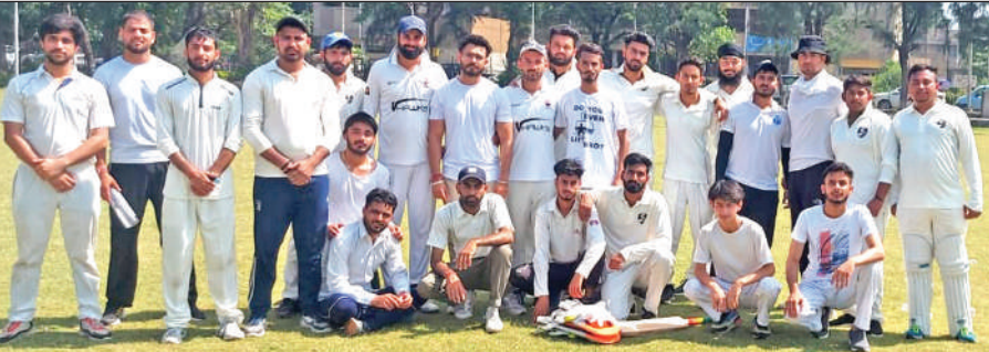
Participating teams posing for photograph at JU on Monday.

■ STATE TIMES NEWS JAMMU: The Inter-Departmental Men Cricket Tournament for the session 2022-23, organized by Campus Sports Committee, University of Jammu commenced at the Directorate of Sports of Physical Education, here on