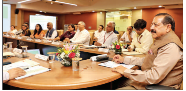
Union Minister Dr Jitendra Singh chairing meeting of Department of Science & Technology at New Delhi on Saturday.

■ STATE TIMES NEWS NEW DELHI: India has produced over 40 "Quantum" technology StartUps in just about 2 years, few of them with global potential, said Dr. Jitendra Singh, Union Minister of State (Independent Charge) for Science and Technology, Minister of State