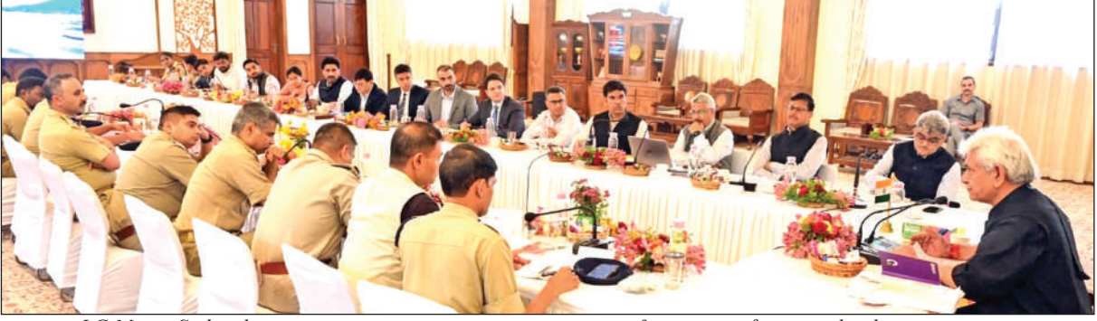
LG Manoj Sinha chairing review meeting on security situation & progress of various development projects with DCs, SSPs of Kashmir Division on Saturday.

■ STATE TIMES NEWS SRINAGAR: Lieutenant Governor Manoj Sinha chaired a high-level meeting on Saturday in the wake of recent terror attacks in the Union Territory and directed officials not to spare those aiding and abetting terrorists and their ecosystem. He also reviewed the progress of various development projects of Kashmir Division. The meeting was attended