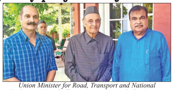
Union Minister for Road, Transport and National Highways, Nitin Gadkari meeting former Sadr-i-Riyasat Karan Singh on Saturday.

■ STATE TIMES NEWS SRINAGAR: Union Minister for Road, Transport and National Highways, Nitin Gadkari met former Sadr-i-Riyasat of the erstwhile state of Jammu and Kashmir Karan Singh on Saturday here and discussed upcoming projects in the Union Territory.