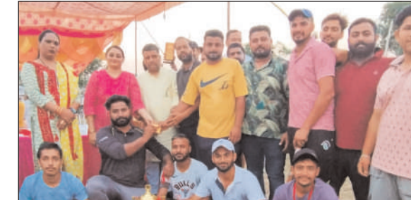
Winner team after receiving trophy.