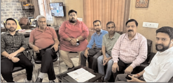
Office bearers of Laghu Udyog Bharati J&K at a meeting.

They proposed making Laundry Soap (Desi Narol Soap) Tax Free as commonly used by the poor. They also suggested exempting GST on the purchase of a residen-