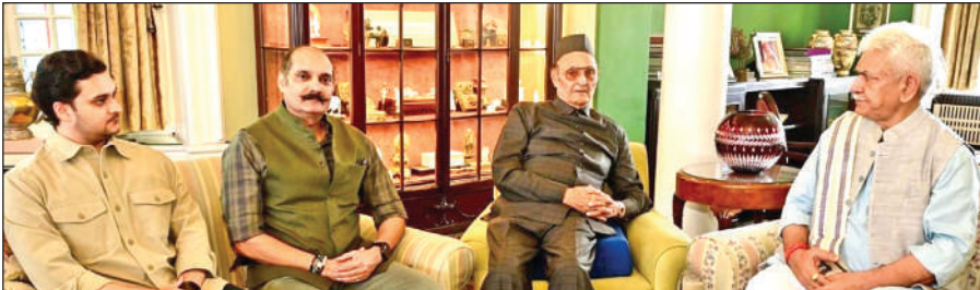
LG Manoj Sinha calling on former Governor Dr. Karan Singh at his residence in Srinagar.