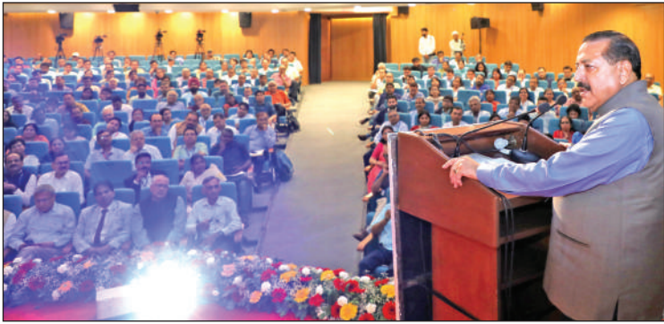
Union Minister Dr Jitendra Singh speaking after launching 'One Week One Theme' campaign under Council for Scientific and Industrial Research (CSIR) at New Delhi on Monday.

■ STATE TIMES NEWS NEW DELHI: Union Minister of State (Independent Charge) for Science and Technology, Minister of State (Independent Charge) for Earth Sciences, MoS PMO, Department of Atomic Energy, Department of Space, Personnel, Public Grievances and Pensions Dr. Jitendra Singh on Monday launched "One Week One Theme" (OWOT) campaign showcasing recent success stories of India in different streams of science and technology. "Our aim is to integrate the efforts of all CSIR labs working on similar projects to reduce overlap and optimise resources," said Dr. Jitendra and said, the 'One Week One Theme' initiative under Council for Scientific and Industrial Research (CSIR) aims to make innovation inclusive for all. Pertinent to mention, 'One week One Theme' is the brainchild of Minister Dr. Jitendra. 'OWOT' is built on the legacy and success of the 'One Week One Lab' (OWOL) initiative started last year. OWOL was also made possible under his guidance. The Science and Technology minister highlighted the aim and objective