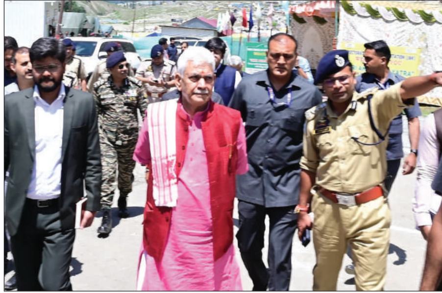
LG Manoj Sinha during visit to Shri Amarnath Ji Yatra Base Camp at Baltal on Tuesday.

The Lt Governor also reviewed the facilities including accommodation, food,