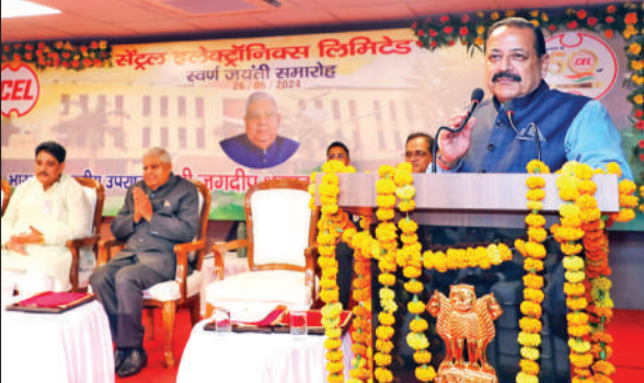
Union Minister Dr Jitendra Singh speaking, in the presence of Vice President of India Jagdish Dhankar, at the Golden Jubilee celebration of Central Electronics Limited (CEL) at Sahibabad on Wednesday.

■ STATE TIMES NEWS SAHIBABAD: Union Minister Dr Jitendra Singh today announced the grant of "Mini Ratna" status (Category-1) for Central Electronics Limited (CEL) at its Golden Jubilee celebration at the Ghaziabad campus. Union Minister congratulated CEL on completion of 50 glorious years in the service of the nation and now celebrating their Golden Jubilee on 26th June this year. Dr. Jitendra said "We feel proud that the Golden Jubilee Celebrations are being graced by the Vice President of India and his guidance and motivation will persuade us to contribute more for the betterment of the country." Adding further the Science and technology Minister said, "50 years of dedication, perseverance, and success is a