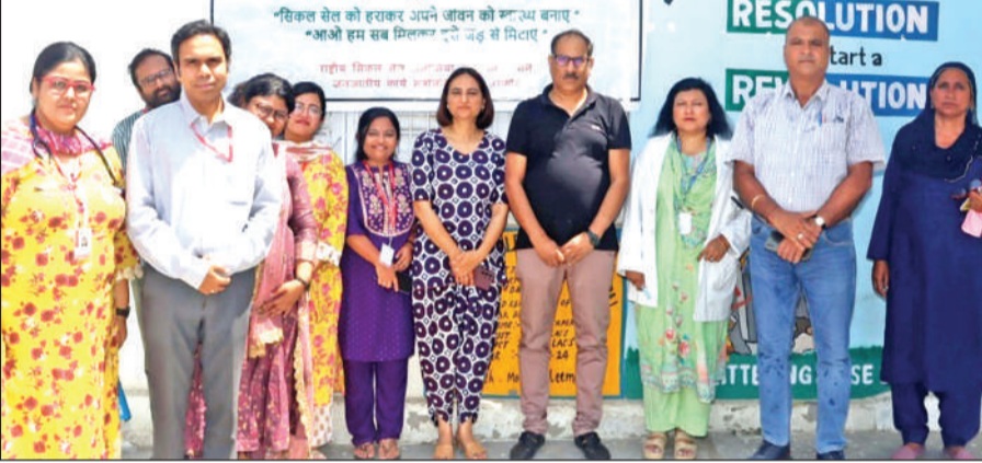
Doctors of AIIMS Jammu and Health Deptt Samba at a programme.