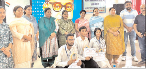
GDC Ramgarh faculty members and students at a programme.