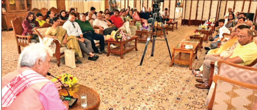
LG Manoj Sinha interacting with Business & Industry leaders at Raj Bhawan on Sunday.

He reiterated the commitment of the UT Administration to meet the aspirations of the people of Jammu Kashmir, saying the path-breaking development has witnessed in the last few years. This is the testimony to our resolve to bring peace, prosperity and establishing transparent, accountable and