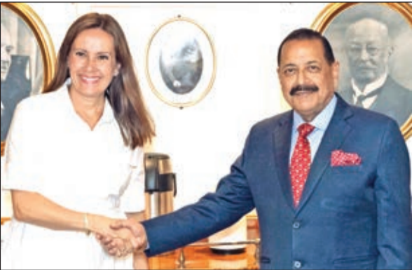
Union Minister Dr. Jitendra Singh and Ms. Marianne Sivertsen Ness, Norway's Minister of Fisheries and Ocean Policy exchange formal greetings before holding "bilateral" at the 'United Nations Ocean Conference' (UNOC3) at Nice, France.

■ STATE TIMES NEWS FRANCE: Union Minister Dr. Jitendra Singh on Friday held a 'bilateral' with Marianne Sivertsen Ness, Norway's Minister of Fisheries and Ocean Policy to discuss a range of issues concerning sustainable fisheries, marine resource management, sustainable fisheries and the broader framework of the blue economy. Later at the delegation level talks led by the two Ministers, India and Norway reaffirmed their commitment to strengthen collaboration on sustainable ocean governance and fisheries during a bilateral meeting held on the sidelines of the 3rd United Nations Ocean Conference (UNOC3), currently underway in Nice, France.