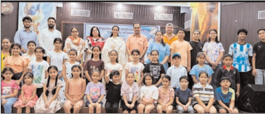
JU faculty posing for a photograph with participating students.

From this year, the workshop is open for the wards of University Alumni in addition to the university employees as