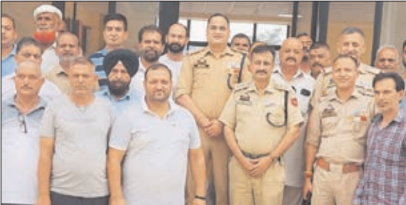
SP Rural Jammu with others at a PCPG meeting.

■ STATE TIMES NEWS JAMMU: In compliance with the directions of SSP Jammu, two Police Community Partnership Group (PCPG) meetings were held by SP Rural Jammu, one at Panjgrain, Nagrota and the other at Saloora, Jhajjar Kotli. The meetings were attended by the local public and shopkeepers along the National Highway, with the objective of strengthening cooperation