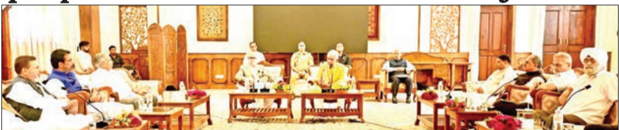
Lieutenant Governor, Manoj Sinha meeting with political leaders at Raj Bhawan in Srinagar on Thursday.