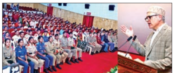
CM Omar Abdullah addressing at special National Integration Camp in Srinagar on Thursday.