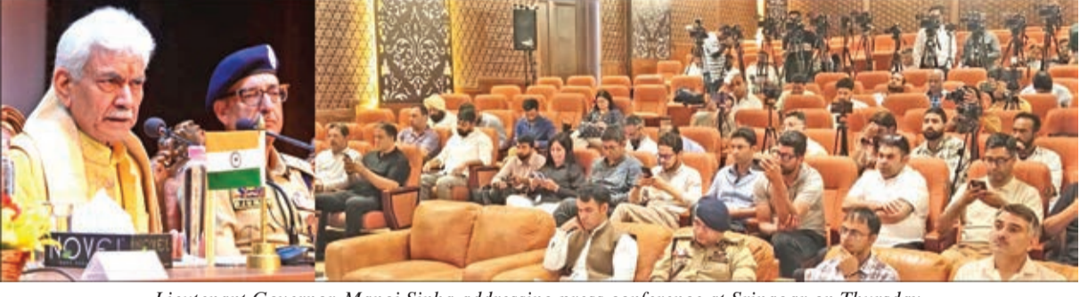
Lieutenant Governor, Manoj Sinha addressing press conference at Srinagar on Thursday.