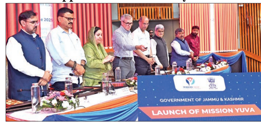
Chief Minister, Omar Abdullah launching 'Mission Yuva' at SKICC in Srinagar. Minister