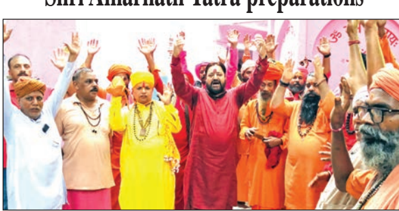
Sant Samaj Nayas members during a meeting.