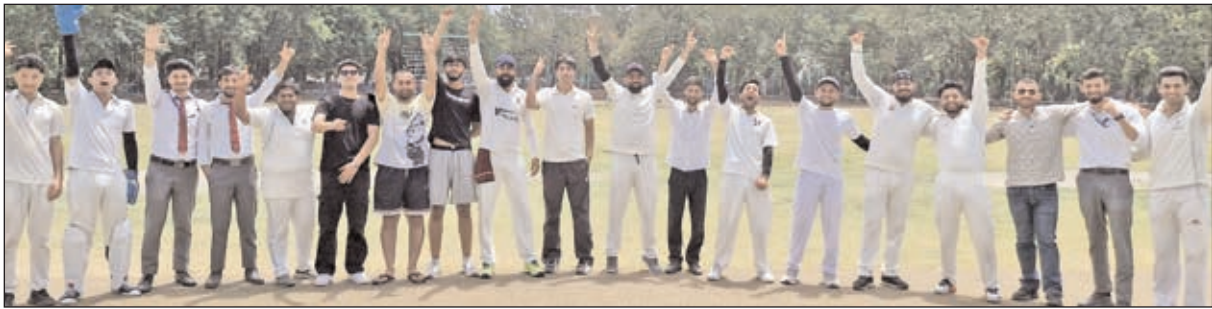
Winner team in jubilant mood at University of Jammu.