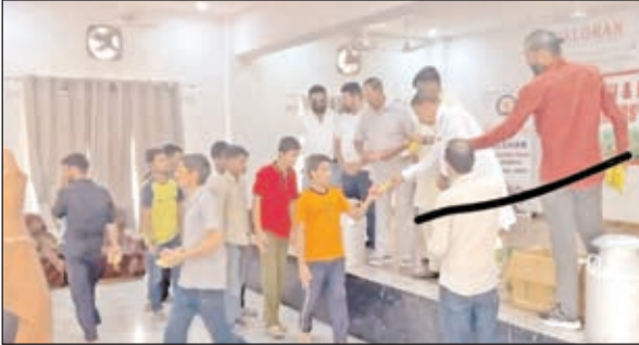
JKDFA members distributing milk among specially-abled children.