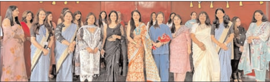
Jodhamal Public School faculty and mothers of students at a programme.