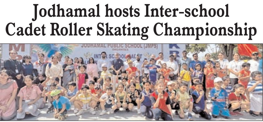
Winner skaters posing for a photograph with dignitaries.