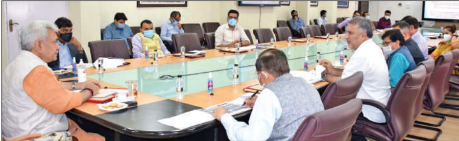
Lt Governor, Manoj Sinha chairing a meeting of Skill Development Department.

Laying special focus on upskilling of the youth in various sectors, the Lt Governor directed the officials of the Skill Development Department to integrate Skill development with Youth