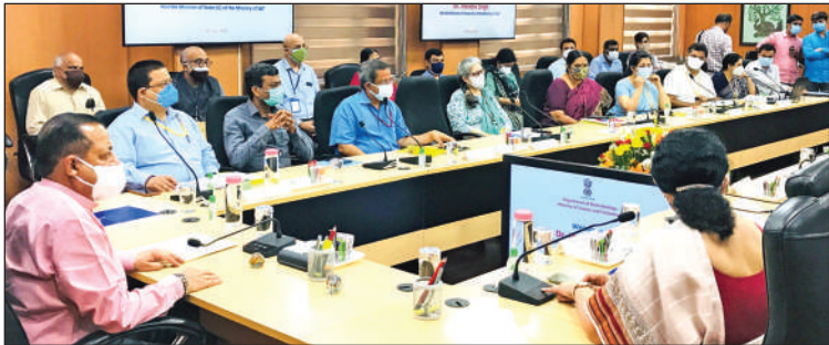
Union Minister Dr Jitendra Singh addressing Biotechnology Scientists at a meeting in New Delhi, on Friday.

Addressing the Biotechnology Scientists during his first review meeting of the Department after taking charge of the new Ministry, Dr Jitendra Singh said, India has huge resource material for both research as well as medical, to offer the world exclusive preventive and therapeutic options, particularly considering the fact that Indian phenotype and India genotype are different from the rest of the world. As a result, both the epidemiology as well as the clinical course of diseases, including the currently prevalent infections due to