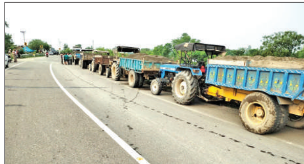
Six vehicles and mining machinery seized in Kathua on Saturday.