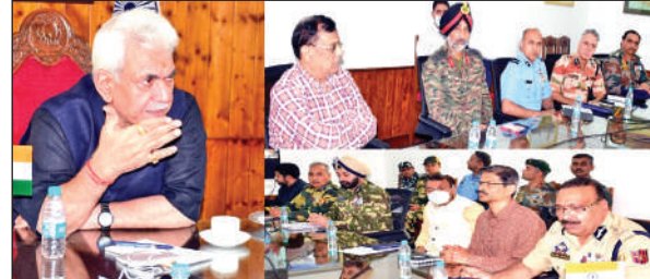
LG Manoj Sinha chairing high level meeting to review rescue & relief operation at Shri Amarnath ji Holy Cave.