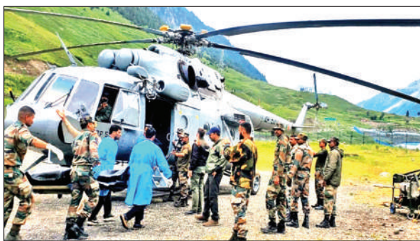
Army chopper evacuating injured pilgrims from Amarnath cave to Nilgaur on Saturday.

"Air rescue operations started Saturday morning and six pilgrims were evacuated by Army helicopters. The military medical teams