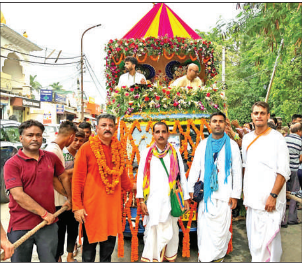
Devotees taking out impressive Rath Yatra of Lord Shree Jagannath at Jammu.