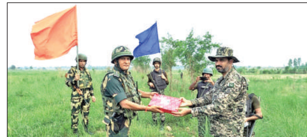
BSF, Pak Rangers exchanging sweets at Int'l Border in Samba sector.