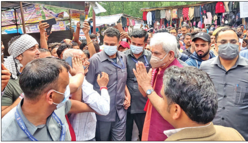
LG Manoj Sinha during his visit to Nunwan, Pahalgam on Sunday. (More pics on pg-9)

Earlier, during the meeting with the officials at the Nunwan Base camp, the Lt Governor was briefed about the rescue and relief operations, debris clearance, deployment of machinery and manpower, camp wise breakdown of the pilgrims, besides the arrangements and