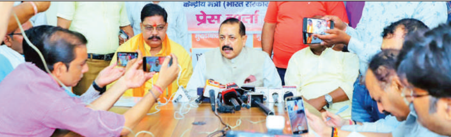
Union Minister Dr Jitendra Singh addressing a press conference at Moradabad, UP on Sunday.