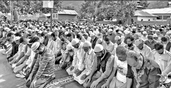
People offering Namaz during Eid-ul-Adha celebrations in Bhadarwah.