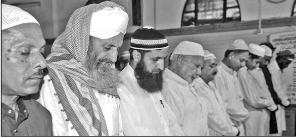
Prayers being offered in a mosque at Kathua.

The biggest congregation took place at Jamia Masjid Sharif Ramban and Eidgah, Banihal, Gool and Batote, where hundreds of devotees performed Namaz-e-Eid and