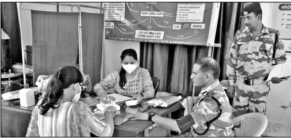
Doctors carrying out tests of Jawans before blood donation.