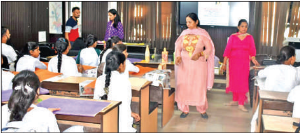
GDC Basohli faculty witnessing paper-bag making competition.