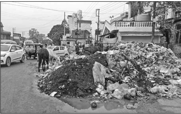
Heaps of garbage lying in Udhampur city.