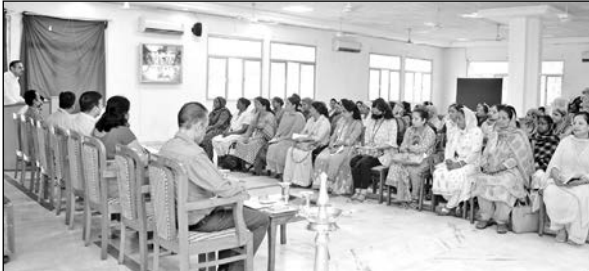
Dignitaries and participants during the session.

length. She further dwelt on the Vishakha Guidelines and gave insights about the Sexual Harassment of Women at Workplace Act 2013. She also shared the importance and working of the Internal Complaint Committee in the institutions and at the workplace to address the challenges of harassment and its prevention.