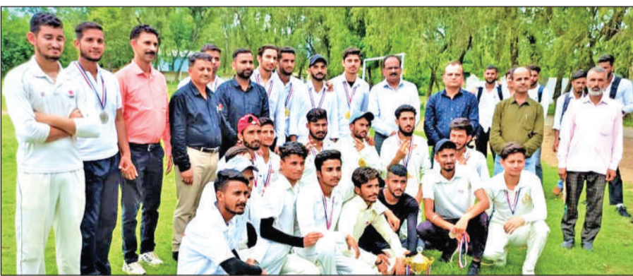
Winner team posing with faculty after receiving trophy.