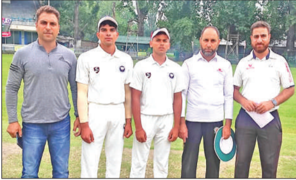
Captains and Umpires during toss at SK Stadium in Srinagar on Saturday.

At one point of time, JKCA Blue were struggling at 44/4, before the pair of