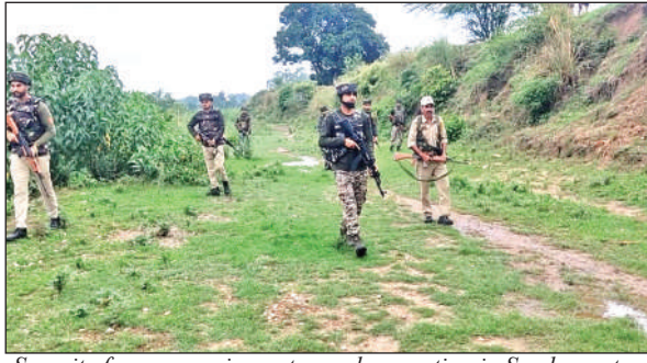
Security forces carrying out search operation in Samba sector.