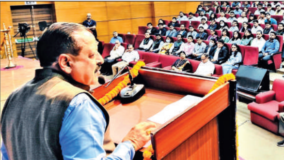
Union Minister Dr Jitendra Singh addressing the 2020 batch IAS officers, at Civil Services Officers Institute, New Delhi on Sunday.

The minister exhorted the young bureaucrats to remain grounded and added that