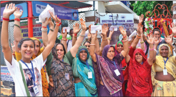
Jubilant pilgrims at Bhagwati Nagar, Jammu before departure to Amarnath cave Shrine on Sunday.