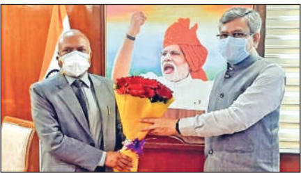
Lt Governor Ladakh, RK Mathur calling on Union Communications Minister, Ashwini Vaishnav.

LEH: The Lieutenant Governor of Ladakh, RK Mathur, met the Minister for Railways, Communications, Electronics & Information Technology, Ashwini Vaishnav, in New Delhi on Sunday.