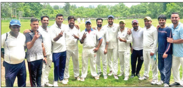
Winner Jammu United team posing for a photograph.