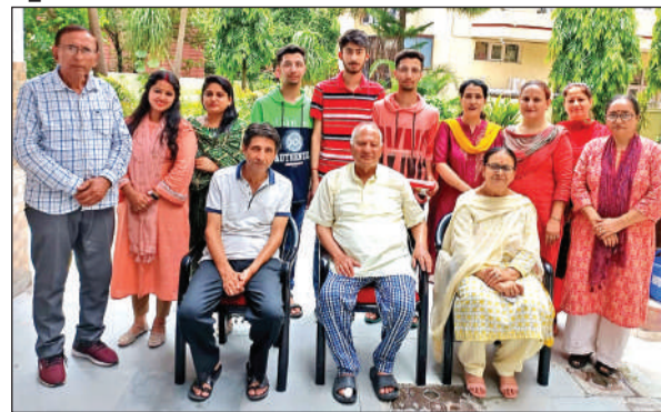
KNIT faculty members posing with position holder students.

Eight students secured positions, 134 Distinction, 77 1st division and seven students got 2nd division.