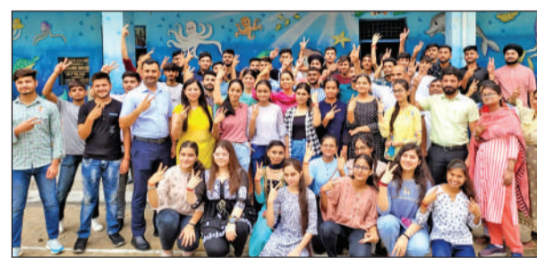
Meritorious students in jubilant mood after passing out Class 12th result.