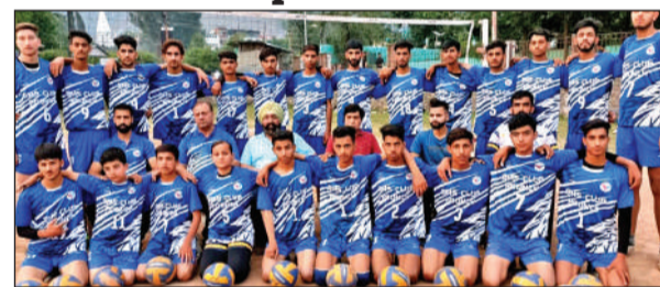
Shaheed Manjit Singh Club members and players posing for a photograph.