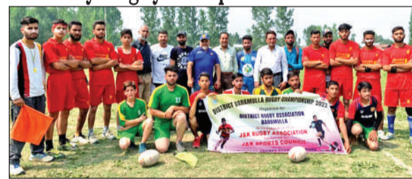
Rugby players posing for a photograph with dignitaries.