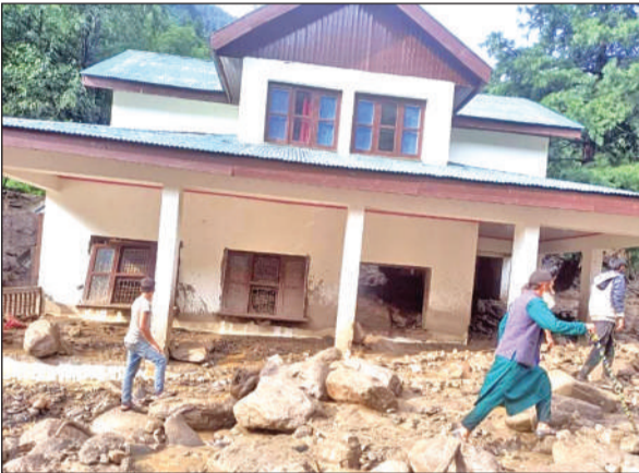
Road washed away due to cloud-burst in Tanta area of Kahara Tehsil.

A portion of the Kahara tourism reception centre, Bhadarwah Development