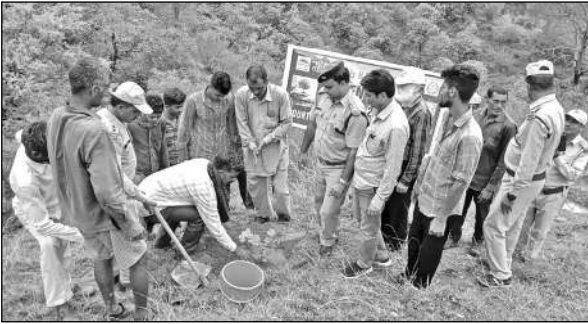
Officials planting a sapling during the drive.

■ STATE TIMES NEWS Mahargarh Forest Range of SAMBA: Forest Department Samba n Thursday launched a plantation drive in Mohargarh Range of Forest Division in which different types of saplings were planted in the area. The drive was also carried out in Bindu Bera area which is also a part of