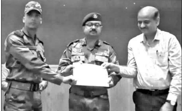
A participant Jawan being given certificate.