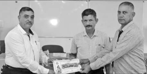
A participant receiving certificate.