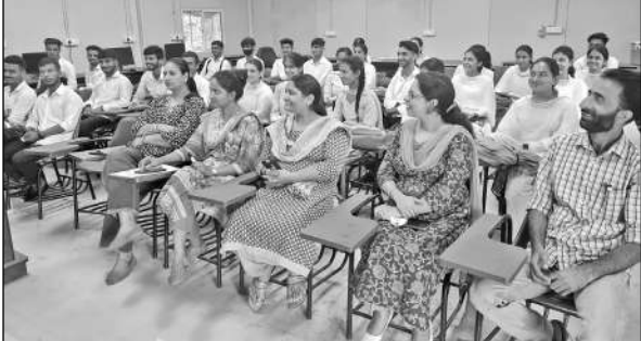
A section of participants during the programme.