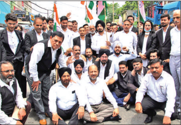
Lawyers raising slogans during a protest at Jammu.