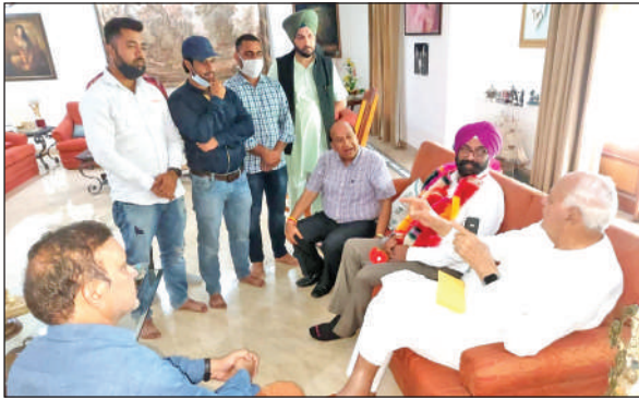
A delegation of FAA aspirants calling on MP Dr Farooq Abdullah.

They added that it is quite unjust that the career of maxi- mum deserving candidates is being marred as they are being forced to pay the price of those