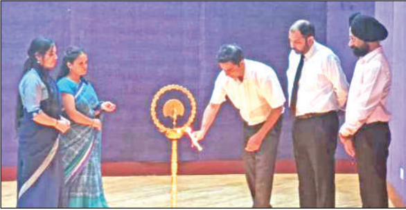
Chief Guest lighting a ceremonial lamp.