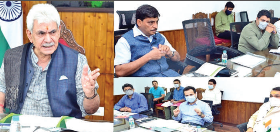
LG Manoj Sinha chairing a meeting to review action plan for revival, restoration, preservation and maintenance of ancient cultural heritage.