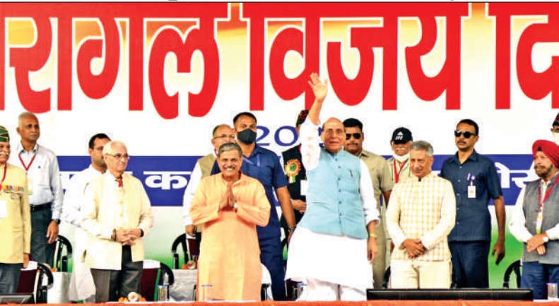
Defence Minister Rajnath Singh during an event organised to commemorate Kargil Vijay Diwas in Jammu on Sunday.

‘PoK part of Indian Territory; will continue to be so’