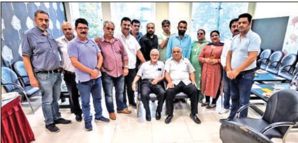
Medical & Surgical Traders Association members during a meeting.