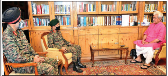
GOC-in-C Northern Command, Lt General Upendra Dwivedi calling on Lieutenant Governor Manoj Sinha.