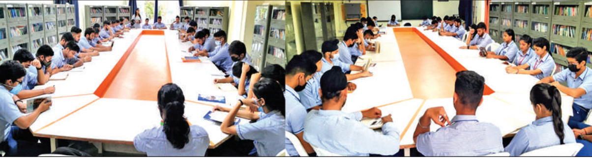
Students of JK Public School Kunjwani reading books in school library.