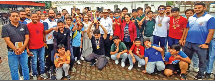
Winners posing for a photograph with officials.